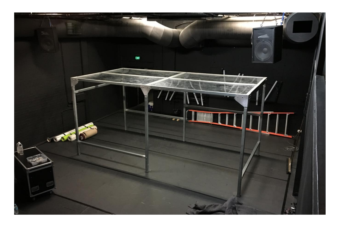
Figure 8: Lifting perspex sheets in to Titan frame