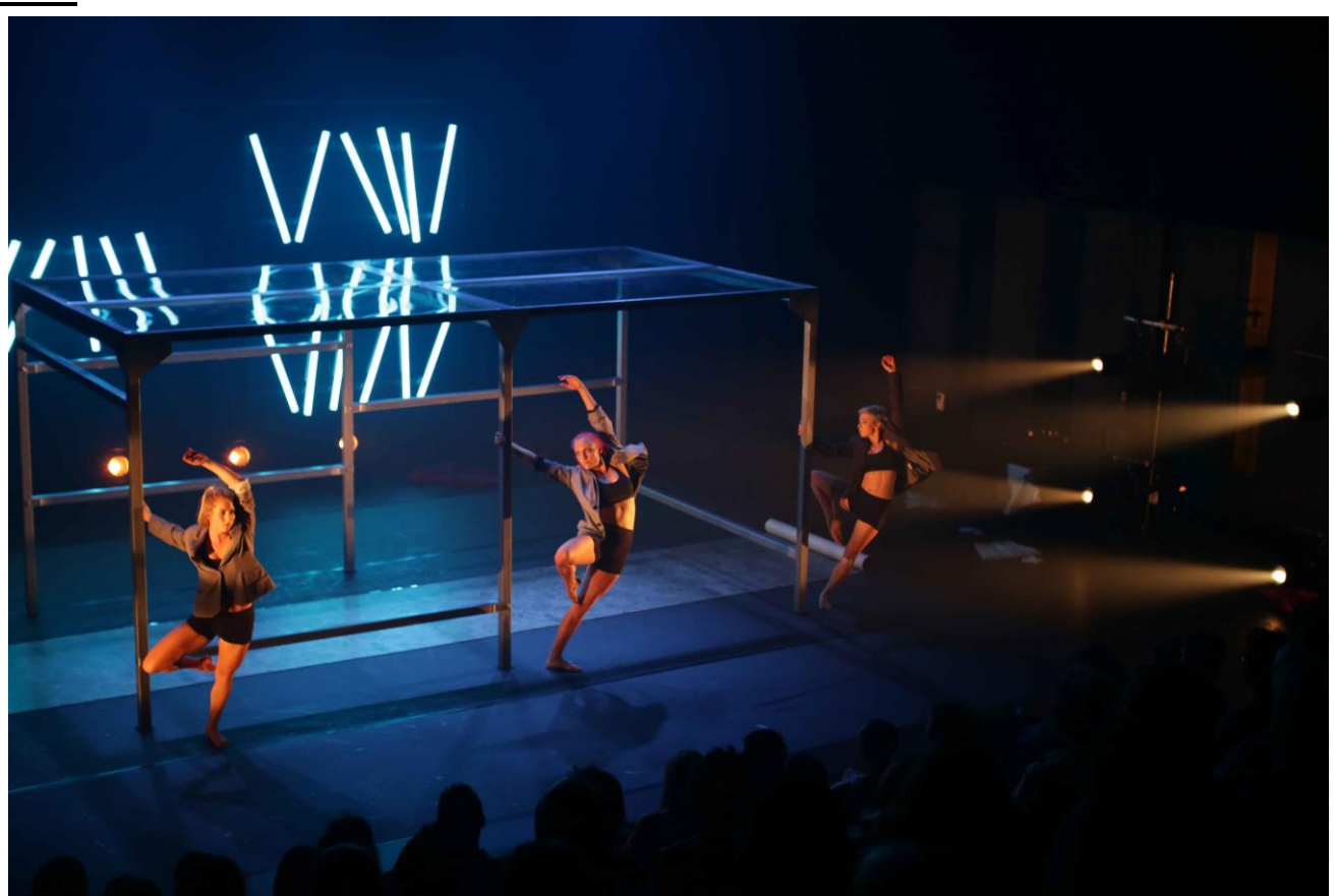
Figure 6: construction